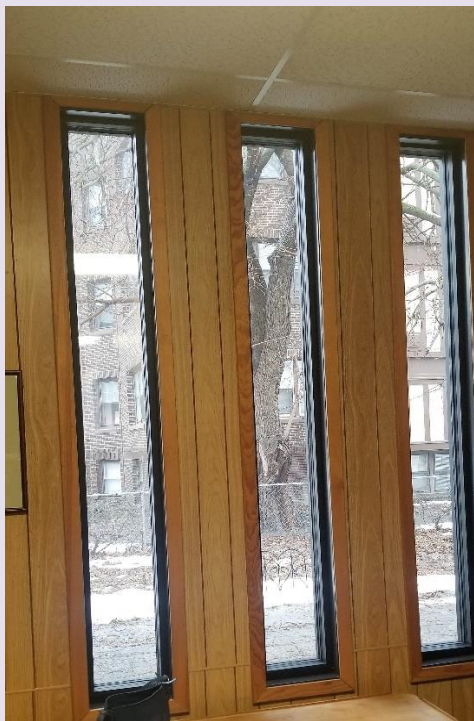
The clear glassed new windows on the west side of the meeting's entryway let a lot more light come in than the old tinted ones they replace. We always appreciate when more Light can enter the meeting. Thanks to Buildings & Grounds for their service.