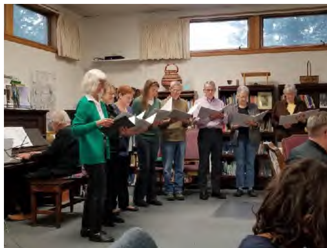
Des Moines Valley singers share favorite songs